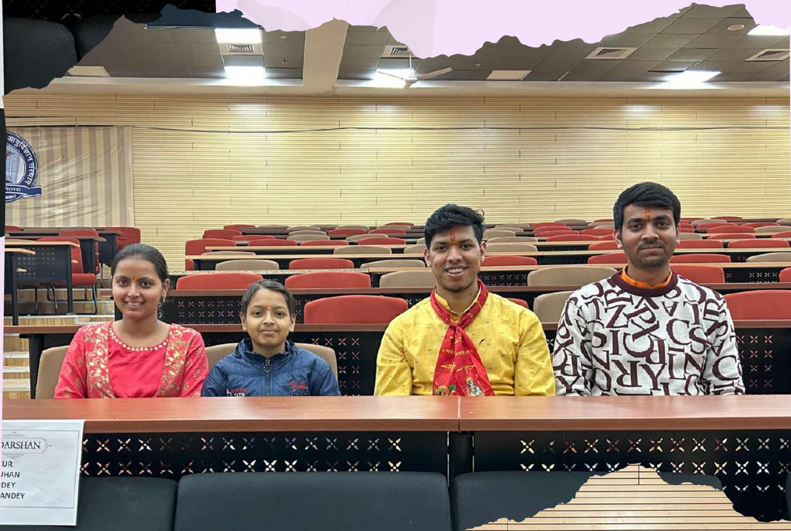
◉ PARSHAN ◉ ➤ SUR ➤ JHAN ➤ DEY ➤ ANDEY